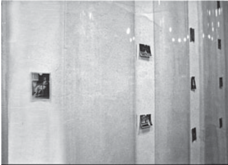
Fig. 5: Carla Accardi, Origine at Cooperativa Beato Angelico (detail), 1976

of new spaces and the development of new display strategies and criteria. 22 It seems reasonable to assume that Accardi, whose interest in transparency and installation had long brought her to consider spatial relations as part of her work, must have been particularly aware of the implications of the exhibition space. The constellation of works at the cooperative bears witness to the operation’s site-specificity. Several pieces from recent years were placed in relation with a newly created installation, and with what looked like an objet trouvé – a unique interplay in Accardi’s oeuvre. As documented by the installation shots, when entering the space, occupying a niche on the right-hand side, a photographic portrait of a young woman in an original wooden frame was on view [fig. 4]. In the passageway, where the open space narrows towards a low chamber, the opposite walls were covered by the above-mentioned, site-specific plastic strips, attached to the upper edge of the wall and the skirting board, but otherwise floating freely. Occupying the five intervals between the six stripes on the right side, nineteen historical photographs of another female figure were pinned to the wall [fig. 5]. Elsewhere, Accardi would title this photographically documented body of work Origine (Origin) , like the exhibition itself. 23