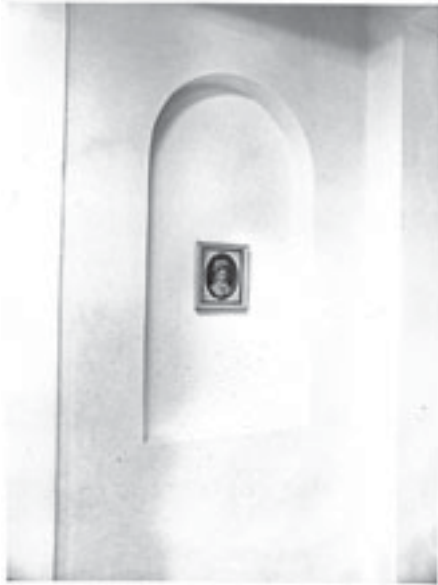
Fig. 4: Carla Accardi, Origine at Cooperativa Beato Angelico (detail), 1976

the declaration insists on the operations of making public and historicizing. The focus on women artists from past and present times was to be set through practices of “presenting” on the one hand, as well as “research[ing]”, “collect[ing]” and “document[ing]” on the other. In autonomously administering art by women artists and its documentation, the cooperative claimed historiographical agency. In so doing, however, the organizers did not seek to provide a systematic overview of women artists past and present, nor did they set explicit selection criteria. Rather, it was precisely the seemingly arbitrary character of the program that recast the relationship between women artists and the art-historical canon in non-compensatory terms, thereby distancing the cooperative from an imitation of implicitly masculine museal models. This free approach to