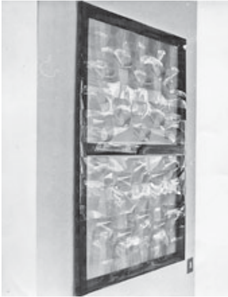
Fig. 6: Carla Accardi, Trasparente , 1975, sicofoil on wood, 130 x 90 cm, collection of the artist, Rome

one of [Accardi's] 'tents'. 24 In the mid-1960s, Accardi had begun applying varnish to prefabricated transparent plastic film (first Perspex, then Sicofoil) and expanded painting into space. Her 1965-66 Tenda (Tent) and Triplice Tenda (Triple Tent) , 1969-71 are fragile environments bearing a domestic reference: mounted on a filigree Plexiglas structure, Sicofoil sheets painted with colorful, repetitive marks are shaped in various space-filling forms recalling tents. If Orienti's observation is correct, Accardi might have shown one of these works, or else a smaller prototype, temporarily placing it in the dead alley, as the cooperative did not have an inner courtyard. 25 While only Orienti mentions this piece, several reviewers speak of the presence, indoors, of other works, Accardi's Trasparenti (Transparents) : unpainted plastic strips stretched across wooden frames, forming minimalist reliefs. The artist had started this series of medium-format pieces in 1974, experimenting with a