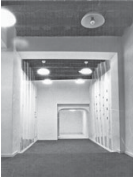
Fig. 1: Carla Accardi, Origine at Cooperativa Beato Angelico, Rome, 1976, installation view, photo: Fondo Suzanne Santoro, Archivia, Casa Internazionale delle Donne, Rome

We are looking into an unpretentious interior supported by a rectangular archway [fig. 1]. The whitewashed wall and ceiling stand out brightly from the dark wooden beams and carpeted floor. A passageway at the rear hints at another room, apparently plastered white. Apart from six symmetrically suspended ceiling lights that – with the exception of one, turned off – appear hazy in the photograph, there is no furniture to be seen. Only at a second glance into the modest room does it become clear what was intended to be captured. On the two opposite walls, a transparent wall covering extends, shortened in perspective, structured into vertical, uniform stripes. Formally identical to its counterpart, the right paneling differs from the left in that it holds nineteen photographs apparently pinned to the wall in between the transparent stripes. Their subject is blurred and unrecognizable from a distance. This black and white view provides