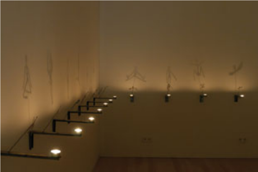
Christian Boltanski, Candles, 1996, installation

It is exactly because of this that mixed emotions, between the phobic and the fetishistic, were especially provoked by shoes, which visually most echoed the feeling of a past presence or of a life that was once, as such, in those shoes, walking on this earth or Earth. This is also why anonymity of the photographed people plays an important role in Boltanski's work, since the question of loss also aims at what the Nazis tried to achieve by destroying all documents and all traces of what they were doing. They wanted to ensure that this or that life never was, that it never happened and that it will leave a trace. In other words, the goal of industrially produced deaths was that lives could not even be counted, let alone named. As if the once living never walked on this earth or Earth, as if they never were. No one will be able to remember them, not even the future generations of Nazis. There is no image of their death because their death never happened. Of course, in art history there are numerous images of death and dying, but the sheer vastness of these images attests to the simple fact that there is no capital image of death as such. There are images, but no (defining) Image. However, when we talk of "no trace of a trace", all these works point to a certain return, to something that could be called a revenant—what returns is a virtual trace in the absence of a positive trace.